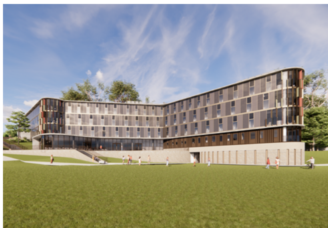
Figure 1 Proposed Boarding School (artist impression)

We selected Buildcorp for their proven expertise, including in safety and traffic management on similar school projects. Their commitment to keeping construction activities completely separate from school operations will maintain a safe learning environment for our students. We are excited to have Buildcorp support us in delivering this important project for current and future students.